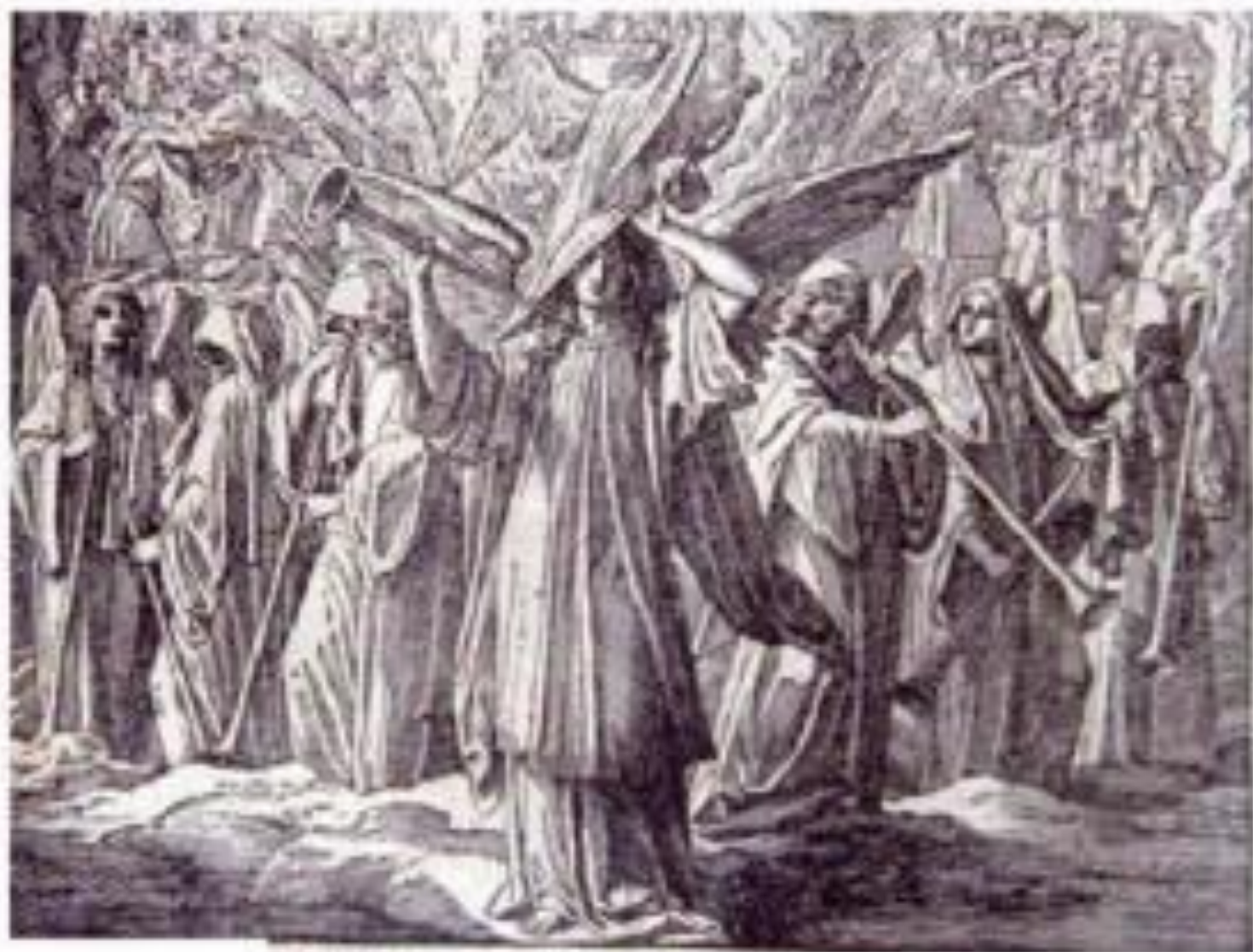
OPENING OF THE SEVENTH SEAL. Rev. viii. 1-6.