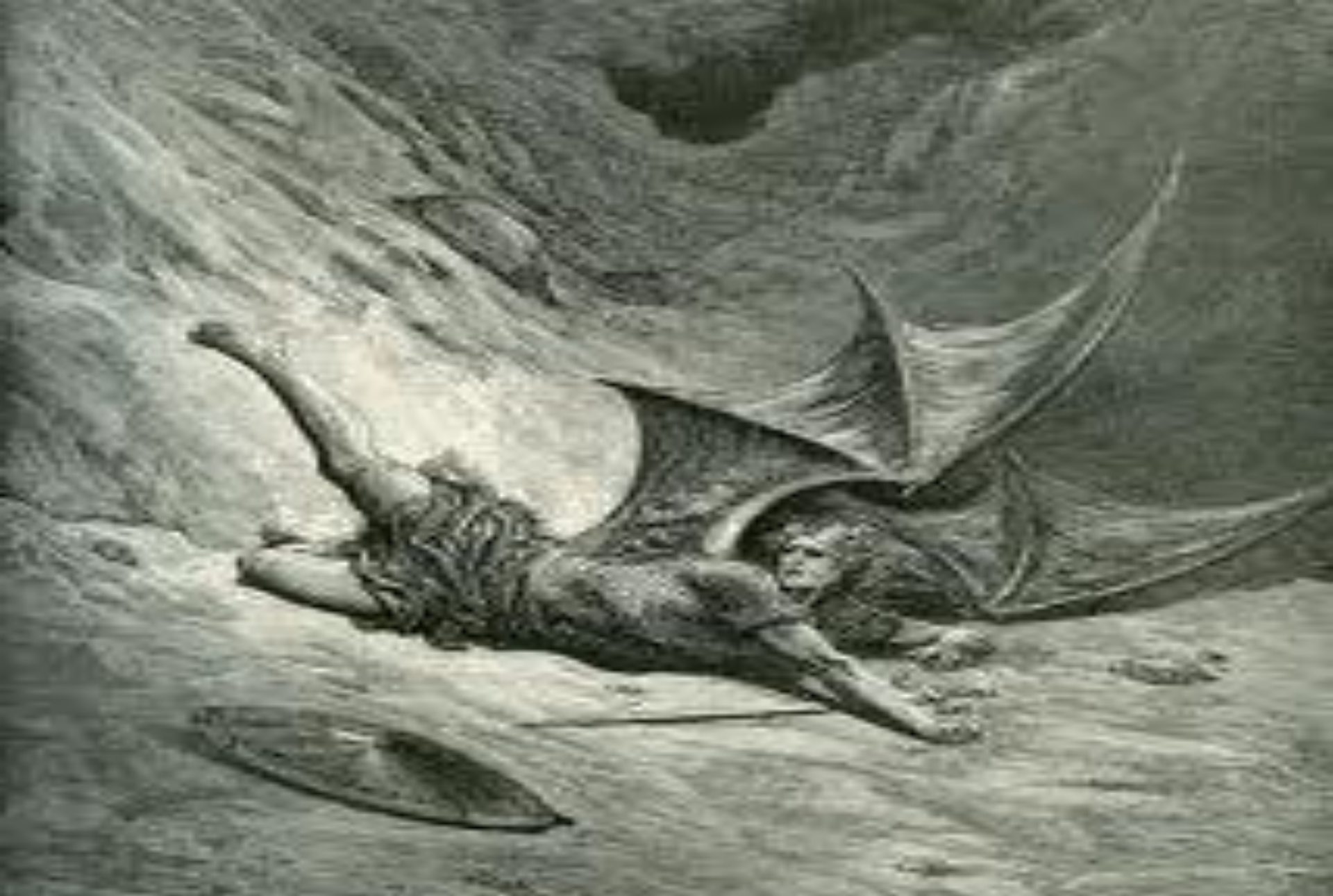
Satan's fall from Heaven