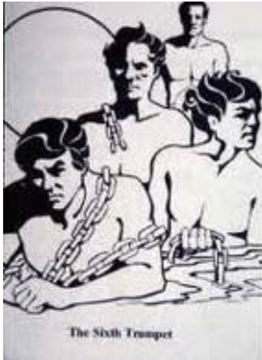
The Sixth Trumpet